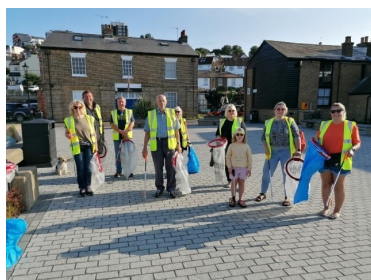
Councillor Litter Picks