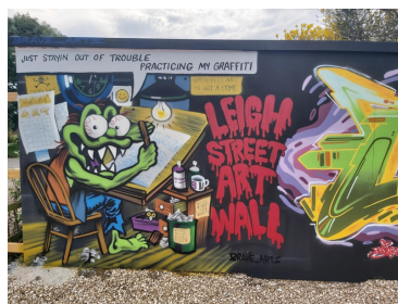
Street Art Wall at Leigh Skate Park