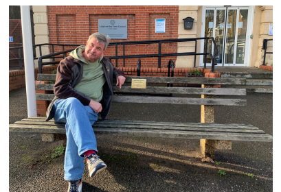
Happy to Chat Bench